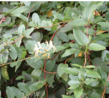
Japanese honeysuckle flowering