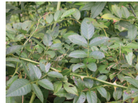
Multiflora rose stem