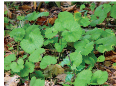
Garlic mustard rosettes