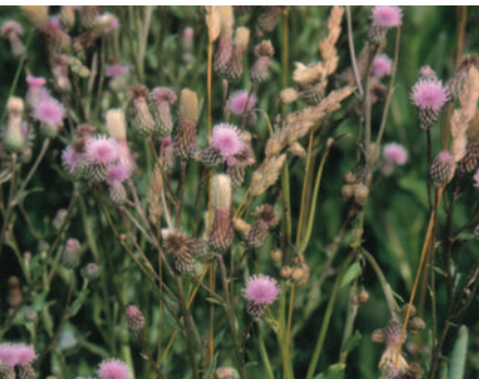
Canada thistle flowering