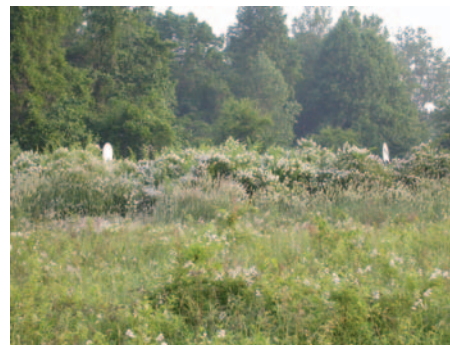
Multiflora rose invading open space

Control: Remove plants by digging out the crown (where roots join the stem). Cut stems can be treated with systemic herbicide to kill roots. A glyphosate-based herbicide, like Roundup Pro®, can be applied to foliage in April and May before most native plants have produced leaves.