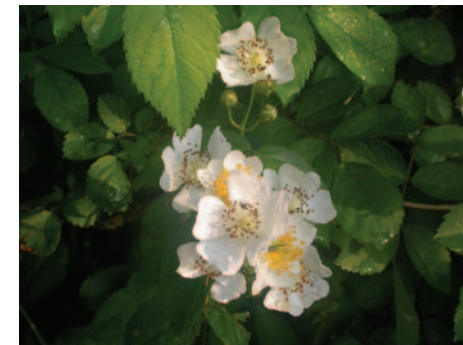
Multiflora rose flowers