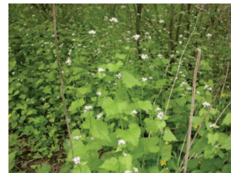
Garlic mustard in natural area