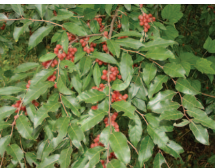
Autumn olive with fruit