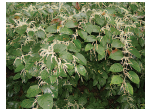
Japanese knotweed flowering