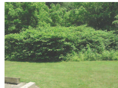
Japanese knotweed mass