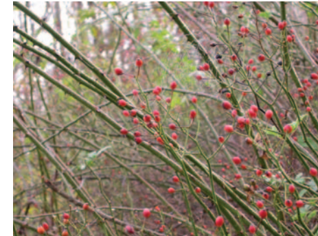
Multiflora rose hips