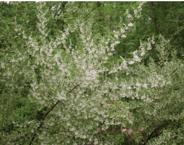
Autumn olive flowering