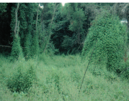
Mile-a-minute with one season's growth