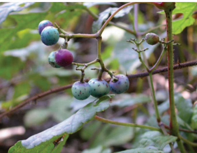
Porcelain berry fruit