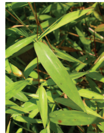
Stilt grass leaves