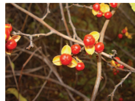
Oriental bittersweet fruit