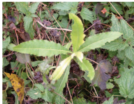
New growth of Canada thistle