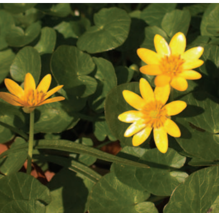
Lesser celandine flowering