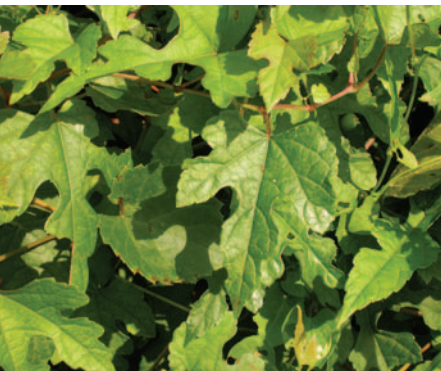
Porcelian berry leaves

Control: Remove smaller vines and roots by hand. For older plants, cut stems and treat cut trunks with a systemic herbicide.