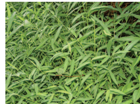
Stilt grass shoots

Control: Remove plants by hand. For large areas, mow in August /September while the plant is in flower to prevent seed production. Monocot (i.e. grasses, sedges, yuccas) specific herbicides may be used in August for extensive infestations when mechanical methods are impractical and when the nearby desirable species are broadleaved plants. Pre-emergent herbicides, applied in early spring, will prevent stilt grass seeds from germinating.