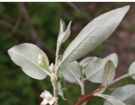
Silvery scales of autumn olive