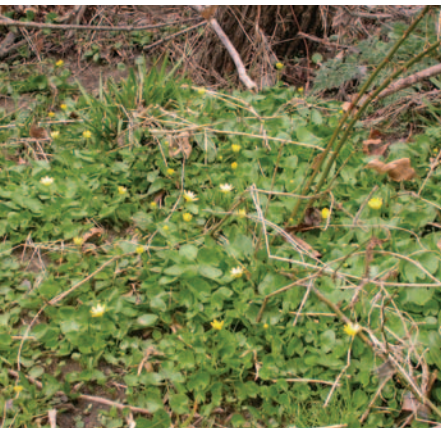
Lesser celandine on forest floor