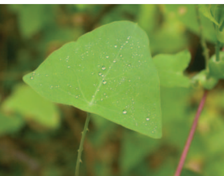
Mile-a-minute triangular leaf and barbs