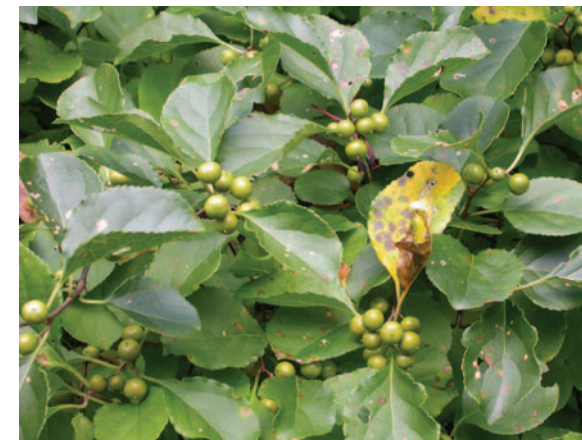
Oriental bittersweet with unripe fruit