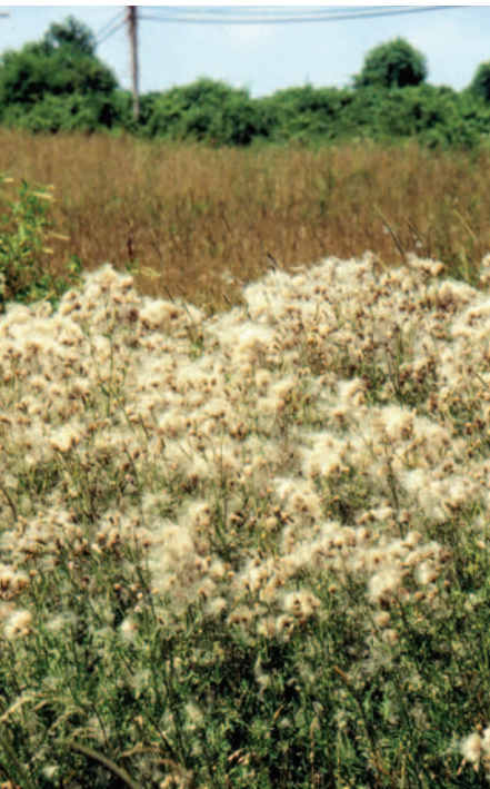
Canada thistle with seeds

Control: Cut or mow down plants in late June when the plant is beginning to flower to prevent seed production. Targeted application of a glyphosate-based herbicide, like Roundup Pro®, or a broadleaf specific herbicide, like Stinger™ or Confront®, is effective. Multiple applications may be necessary.