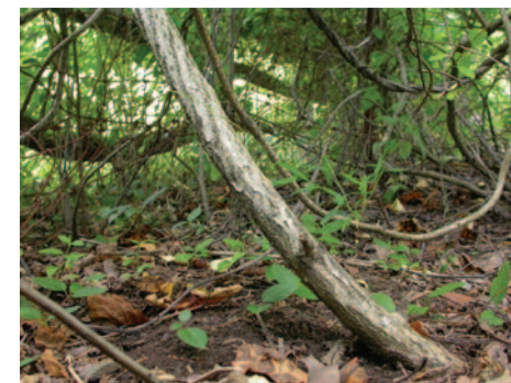
Oriental bittersweet trunk

Control: Remove smaller vines and roots by hand. On older plants, cut trunks and treat with a systemic herbicide to kill the roots.