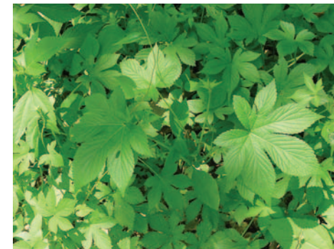
Japanese hops leaves

Control: Pull plants anytime before September to prevent seed production. When pulling the plants, attempt to remove as much of the rootstock as possible to reduce resprouting. Spot applications of a glyphosate-based herbicide, like Roundup Pro®, prior to flowering, should damage the plant enough so it will not be able to flower and set seed. Japanese hops seed is typically exhausted in three years. The first two years of control will be the most time-consuming. After that, the number of plants will drop dramatically.