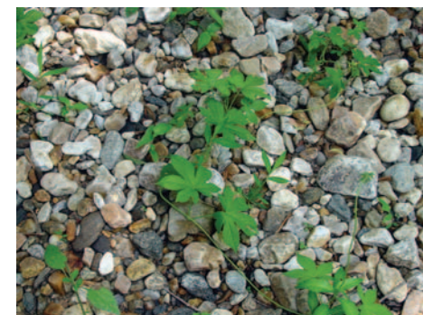
Japanese hops vine