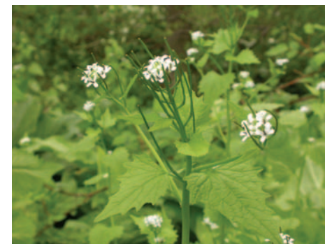
Garlic mustard flowering

Control: Remove plants by hand during flowering in June and early July to prevent seed production. Destroy flower stalks to prevent seed from forming on plants cast aside. Large patches can be mowed close to the ground while in full bloom to prevent seed development. Spray year one rosettes with a glyphosate-based herbicide, like Roundup Pro®, in mid-November to early winter when other plants are dormant and garlic mustard is still green.