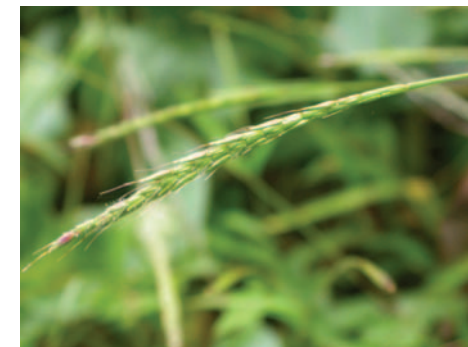
Stilt grass seed